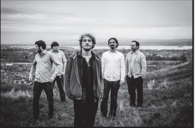
From the CMA website:

The 25th anniversary season of Celtic Music Association concerts is upon us. This weekend, catch Dallahan at Holy Trinity Parish Hall at 8 p.m.