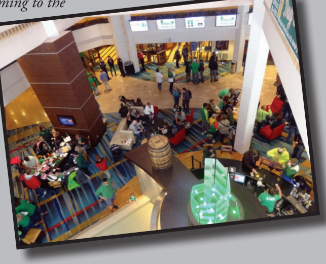
Irishman of the Year

functions enjoyable. This is why I show up and help whenever I can. To be recognized for that is icing on my cake. I gladly accept the recognition but know that is not the reason that I show up and do what I do. I hope I can live up to the responsibilities throughout the year."