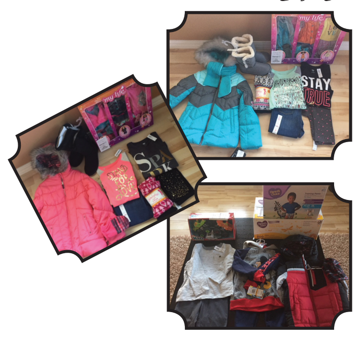
Each child received a London Fog winter coat, two outfits, boots, a toy and accessories.