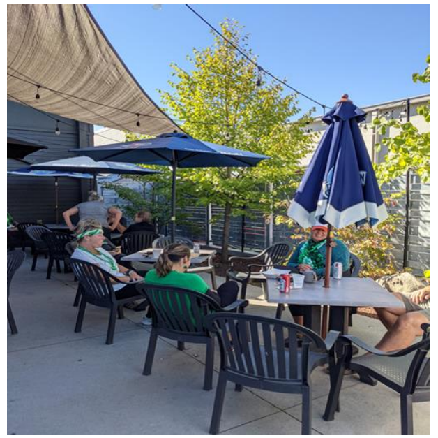
Riders getting hydrated at Sully's