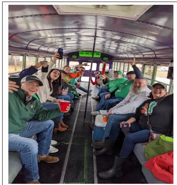
2022 Pub Crawl