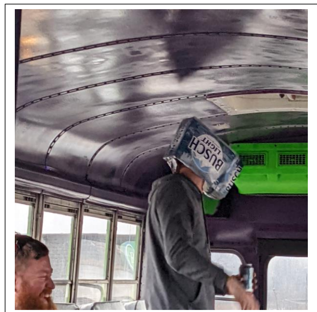
Colt brings a new meaning to the term 'Beer Goggles'