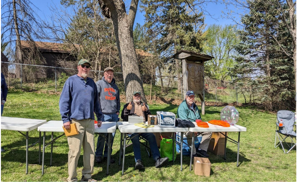
Our Tourney Committee