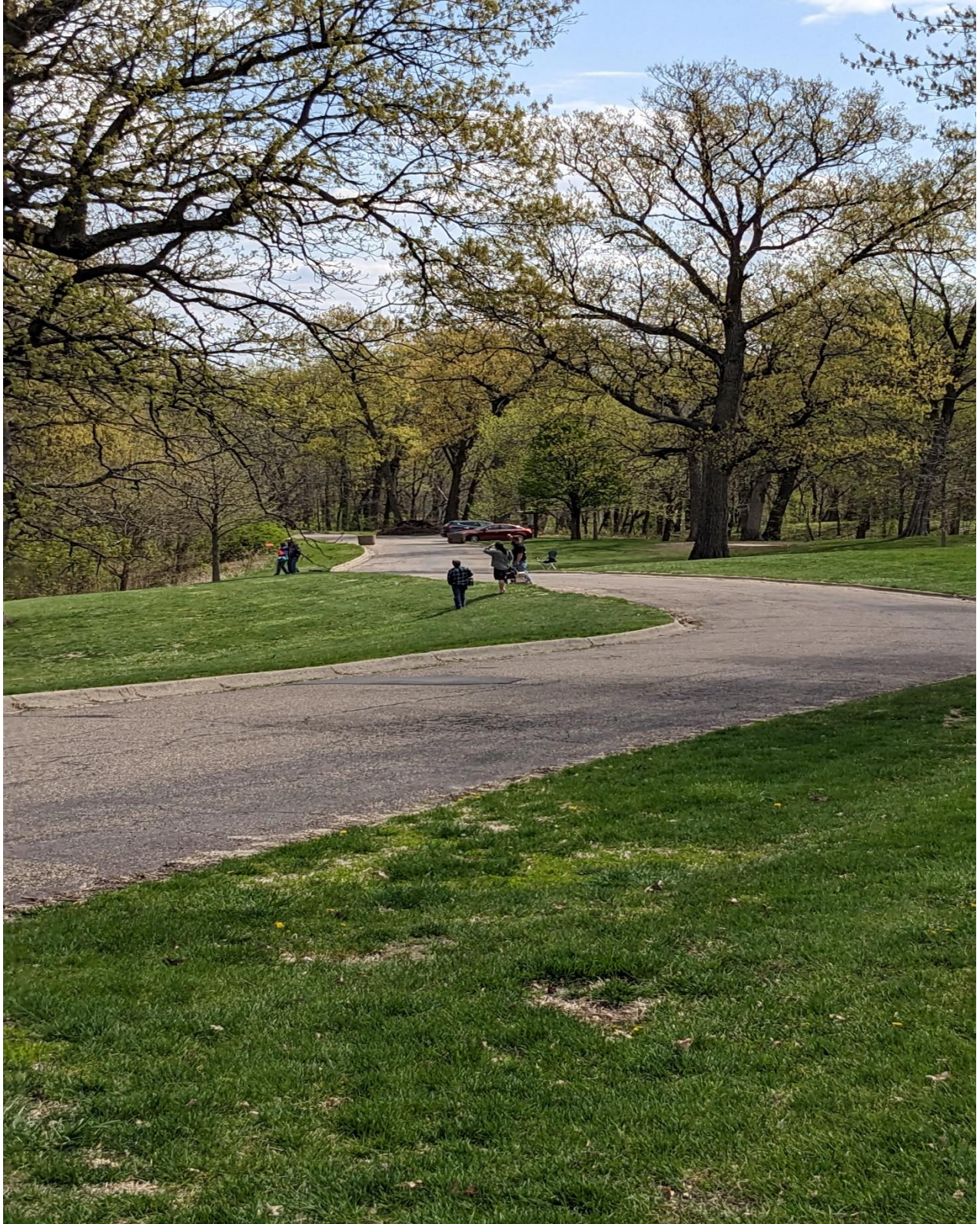
Teams prepare to take their shot at the putting contest.