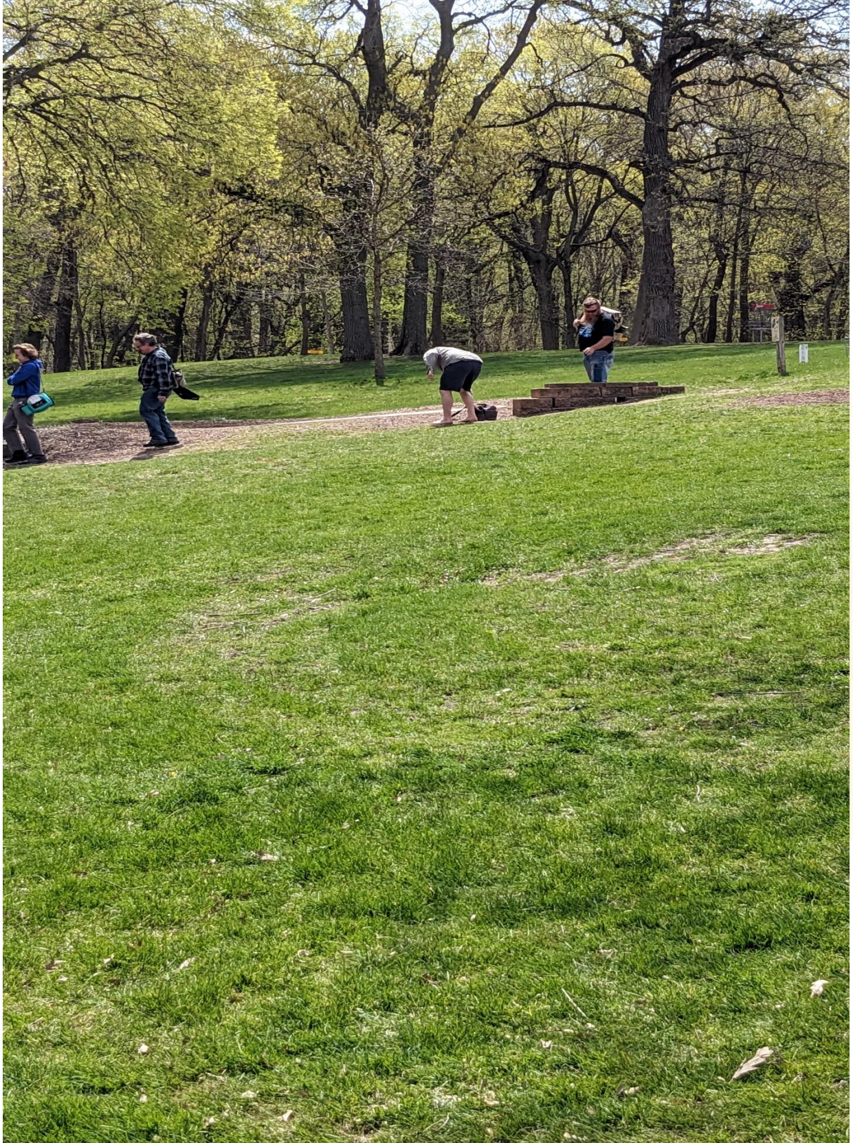
Teams prepare to tee off.