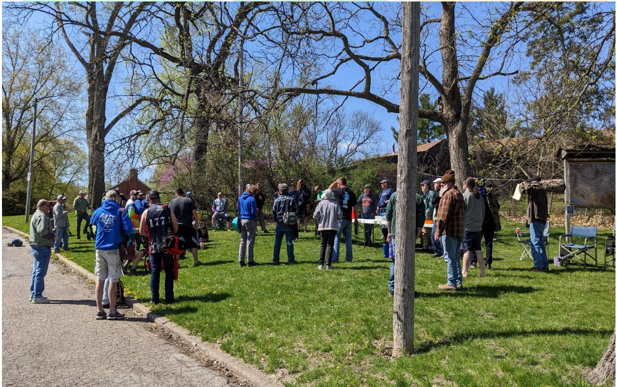
A beautiful day for disc golf??